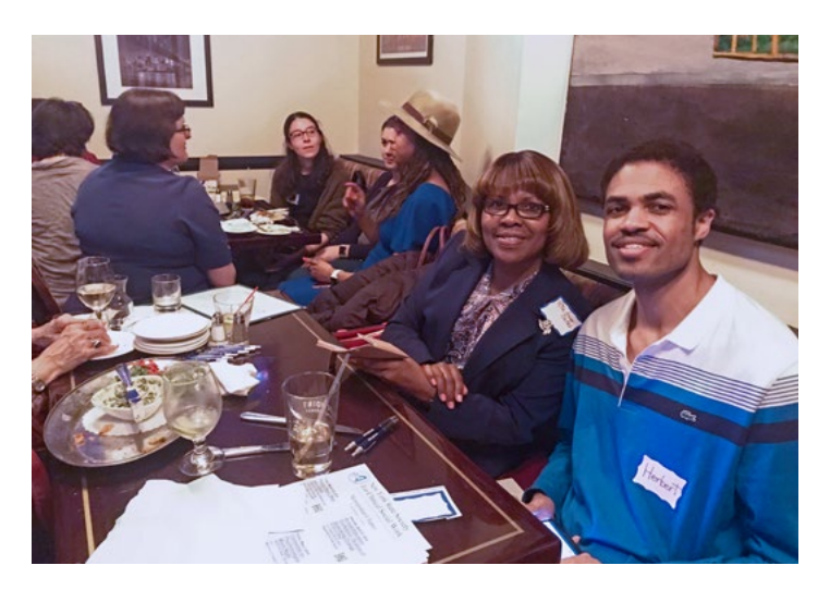
Students at the Met Chapter's Happy Hour in March.

Overall, the Society is doing well in recruiting new members to all chapters. While the State and Chapter Membership Committees continue their work, each member can extend our outreach efforts. I would love to hear from anyone who has ideas about what might work, locally or statewide. Along those lines, please keep an eye out for the re-launch of the Member-Get-a-Member program, featuring our new NYSSCSW tote bags.