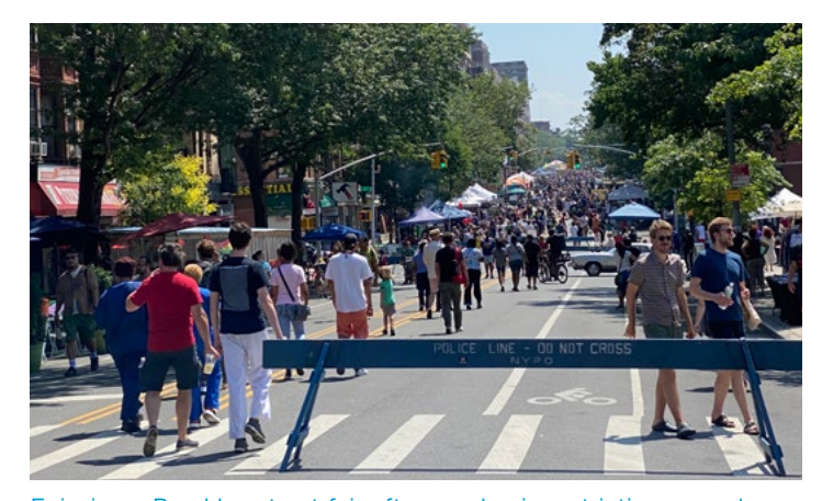
Enjoying a Brooklyn street fair after pandemic restrictions eased.

I was not surprised to learn that the majority wanted to use a hybrid approach. While most agreed that the engagement process with telehealth might be longer or more challenging, they were enthusiastic about making eventual connections and engaging new patients using the technology.